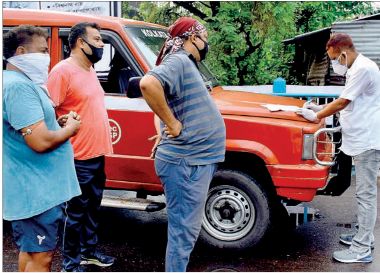
নিয়ম ভেঙে গাড়ি বের করার জরিমানা করছে পুলিশ। কুঁদঘাটে, বৃহস্পতিবার।

কলকাতায় লকডাউন ভাঙার জন্য সারাদিনে ৭২১ জনের বিরুদ্ধে ব্যবস্থা নিয়েছে। মাস্ক না পরার জন্য ধরা হয়েছে ৩৫২ জনকে। গাড়ি বাজ্যোগ হওয়ায় ৩০টি। যাত্রার খুঁত ফেলার জন্য মামলা হয়েছে ২১ জনের বিরুদ্ধে। বৃহস্পতিবার থেকেই কলকাতার বিভিন্ন থানা এলাকায় পুলিশ টহলদারি ছিল। কোথাও কোনও জমায়ত বা আড়াল ঘটা ঘটেনি। সকাল সাড়ে ৮টায় অমহাস্ট্র স্ট্রিট, সাউথ-ইস্ট ডিভিশনের কয়েকটি থানা এলাকায় ড্রোন উড়িয়ে লকডাউনের পরিস্থিতি দেখা হয়। এরপর পর্যায়ক্রমে সকাল ৯টায় বড়বাজার, গার্ডেনরিচে। বিকেল সাড়ে ৩টায় শ্যামপুর, ফের সাউথ-ইস্ট ডিভিশনের কয়েকটি থানা এলাকায় ড্রোন ওড়ানো হয়। বিকেল ৪টায় মুচিপাড়া এবং দক্ষিণ বন্দর থানা এলাকায় ড্রোন উড়িয়ে পরিস্থিতি দেখা হয়। গিরিশ পার্ক, পার্কসার্কাস, পার্ক স্ট্রিট, মেটিয়াবুজ, শ্যামবাজার, রেড রোড, বিটি রোড, ডায়মন্ড হারবার রোডে দেখা যায় একেবারে জনশূন্য। সকাল থেকেই ট্রাফিক বিভাগের সহকারী কমিশনাররা রাস্তায় ছিলেন। বিভিন্ন ট্রাফিক গার্ডের ওসি ও অন্যান্য অফিসার, সার্জেন্টরা টহল দিয়েছেন সর্বমুঠ এলাকাগুলিতে। স্থানীয় থানাও নজর রেখেছে পরিস্থিতির ওপরে। যুক্তিযুক্ত কারণ